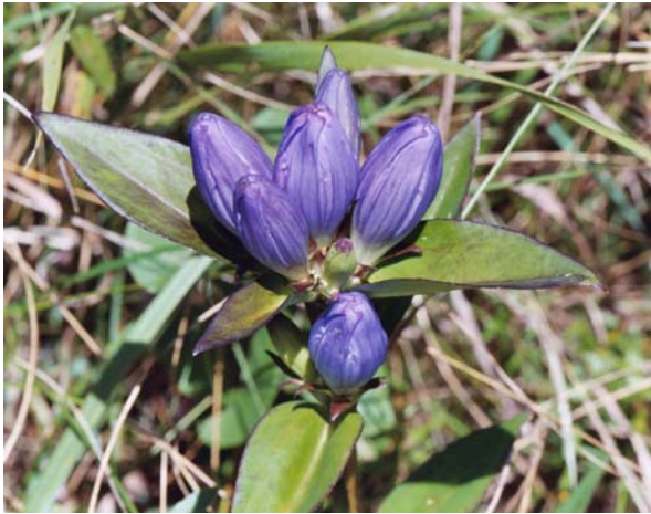
Closed gentian