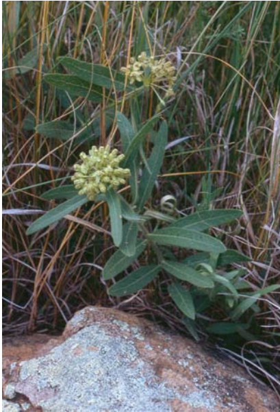
Woolly milkweed

Marshall County. The woolly milkweed may now be extirpated from northeast SD.