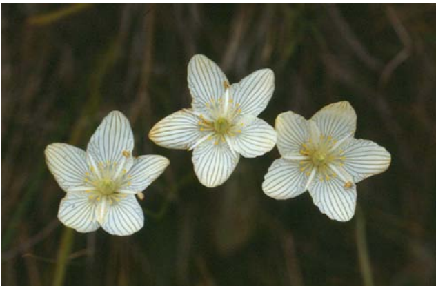
Thick-leaved grass of Parnassus

The Northern green bog orchid and Loesel's twayblade are two very inconspicuous native orchids, which could be easily overlooked in the field. In fact, the Loesel's twayblade was only recently discovered to be growing in northeast South Dakota in 1990s. The twayblade grows in calcareous fens, the bog orchid has been observed in the same habitats as the twayblade, but may also grow along the wet margins of streams and wetlands.