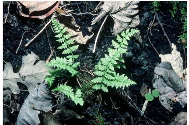
Common bladderfern

Our largest orchid occurs in the rich woods of Sica Hollow and a few other undisturbed coulees located in Marshall and Roberts Counties. It may also grow along the edges of wetlands and fens where it was once known to occur on the Waubay National Wildlife Refuge and a few wetland sites in Grant County. The yellow lady's slipper blooms mid-May.