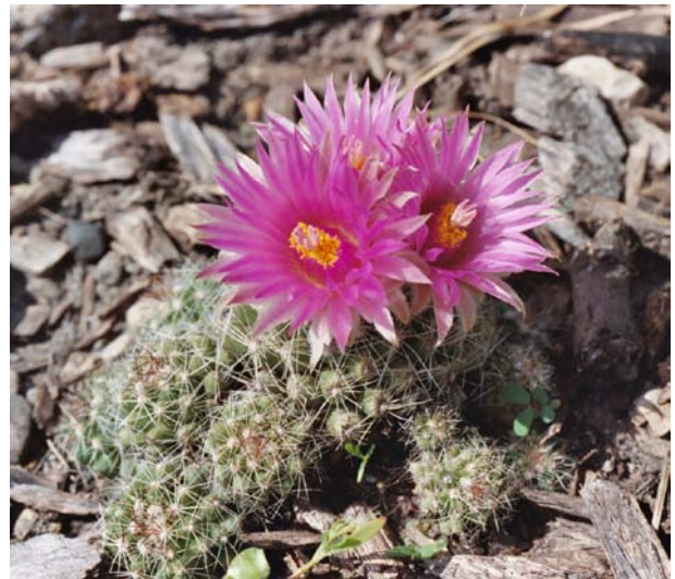
Purple pincushion

Aster sagittifolius Arrow-leaved aster Aster sericeus Silky aster Astragalus absurgens Standing milkvetch Astragalus agrestis Field milkvetch Astragalus crassicaarpus Prairie plum, Groundplum milkvetch Calylophus serrulatus Toothed-leaved evening primrose, Yellow evening primrose Castilleja sessiliflora Downy paintbrush Cerastium arvense Prairie chickweed Chrysopsis villosa Hairy goldaster Comandra umbellata Bastard toadflax