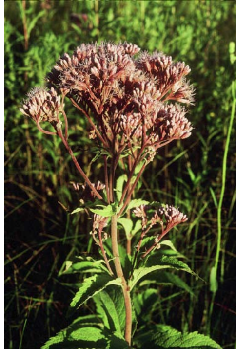
Joe-pye weed

The touch-me-nots grow along the edges of woodland streams and springs. Ruby-throated hummingbirds are often observed sipping nectar from these flowers at Sica Hollow and Hartford Beach State Parks, July through September.