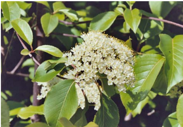
Nannyberry

Symphoricarpos occidentalis Western snowberry Tilia americana Basswood Toxicodendron rydbergii Poison ivy Ulmus americana American elm Ulmus rubra Slippery elm