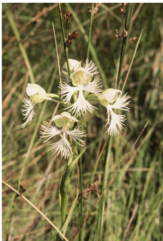
Western prairie fringed orchid

None of the above species are currently listed as state or federally endangered at this time. However, one federally threatened species, the western prairie fringed orchid (shown below), may possibly occur in the area. Any observations of this plant should be reported to the S.D. Dept. of Game, Fish, and Park's Natural Heritage Program or the U.S. Fish and Wildlife Service.