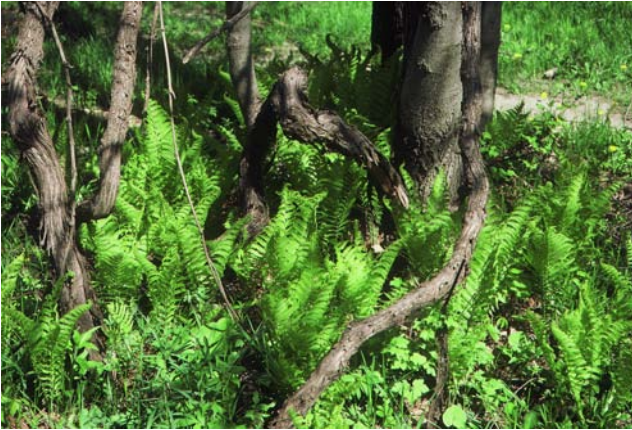
Ostrich ferns, Munson Gulch

The plants listed and shown below occur in the woodlands and forests of northeast South Dakota. Ecologists have classified the larger forest communities of northeast South Dakota as Northern Bur Oak Mesic and Plains Basswood forests. These two forest communities are found in the coulees located along the eastern slope of the coteau in Marshall and Roberts Counties including Sica Hollow State Park. Smaller forests with these plant communities are found at Hartford Beach State Park, and the Hatchery Creek Public Access on Pickerel Lake. Another forest community Bur Oak Savannah is found on the Waubay National Wildlife Refuge. The majority of woodland wildflowers bloom from mid-May through early June.