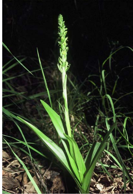
Northern green bog orchid

Platanthera aquilonis Northern green bog orchid