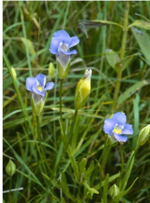
Fringed gentian

The marsh marigold is found growing along spring fed creeks in Sica Hollow and Hartford Beach State Park and elsewhere. One of the earliest wildflowers to bloom in northeast South Dakota, late April through early May.