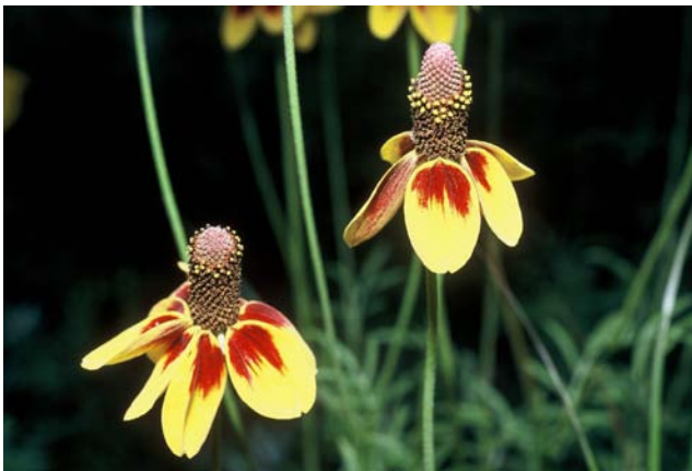
Prairie coneflower

Pediomelum esculentum Prairie turnip, Breadroot scurfpea