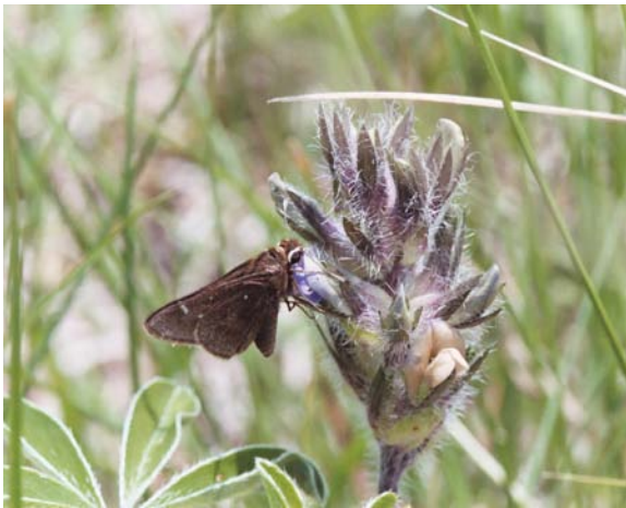
Dusted skipper nectaring on prairie turnip

Pediomelum argophyllum Silver-leaved psoralea, Silverleaf scurfpea