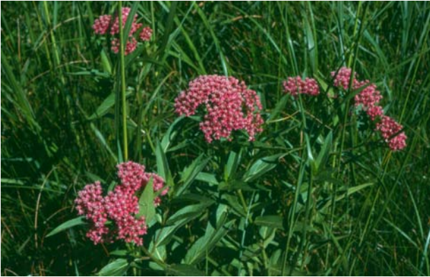
Swamp milkweed