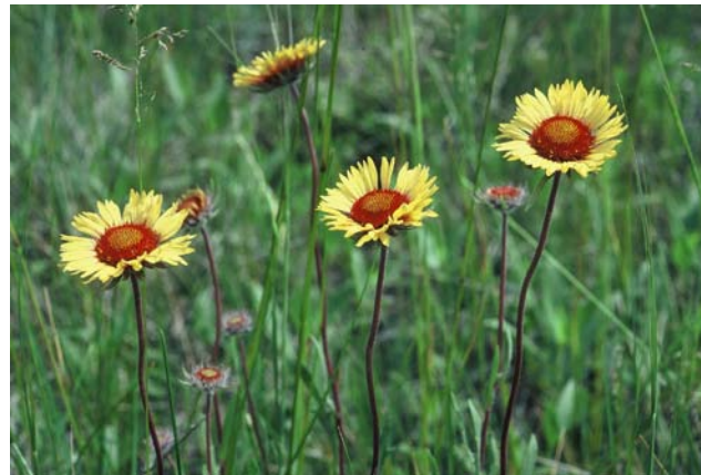
Blanket flowers

Obviously the best and most enjoyable times to observe wildflowers are during the season in which they are in bloom. In northeast South Dakota the majority of our native prairie forbs blossom from mid-June through early September. These are the warm season species that take advantage of cool wet springs to develop and mature during the usually warm dry days of summer. The majority of these warm season species are in bloom by early July. These include some of the showiest and easiest species to identify; yarrow, leadplant, yellow evening primrose, prairie clovers, coneflowers, and the wild lily. As these species fade by late July, whole new sets of plants begin to color the prairie. By late August the milkweeds, goldenrods, asters, gentians, and gayfeathers are in bloom. During May and early June the cool season forbs and grasses appear. One of the first wildflowers to bloom in the spring is the pasqueflower, followed in late May and early June by blue-eyed grasses, prairie smoke, prairie violets, and puccoons. Listed and shown below are some of the more common wildflowers found on northeast South Dakota's tallgrass prairies.