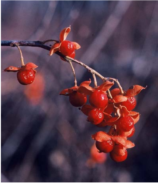
Climbing Bittersweet