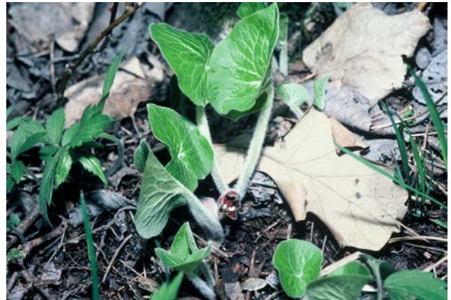
Wild Ginger