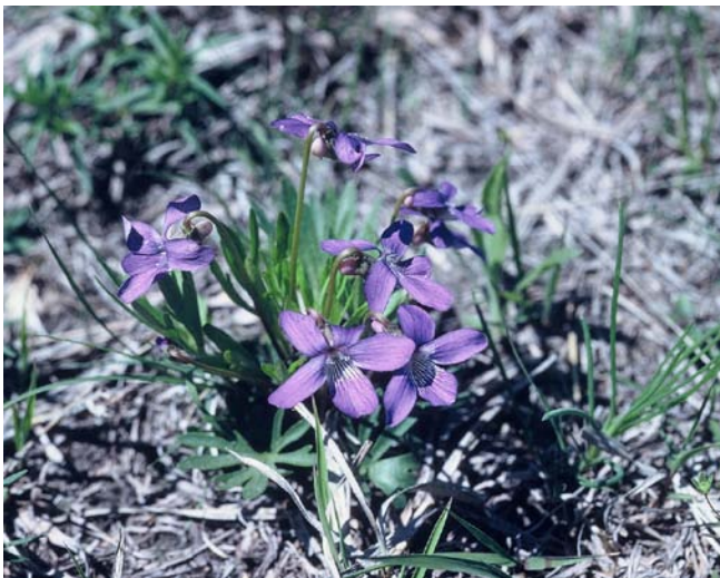
Prairie violet