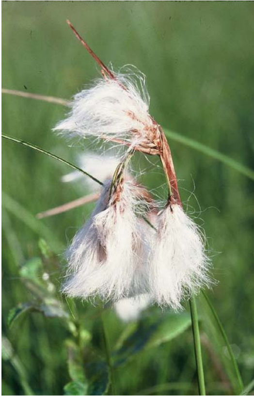
Narrowleaf cottonsedge