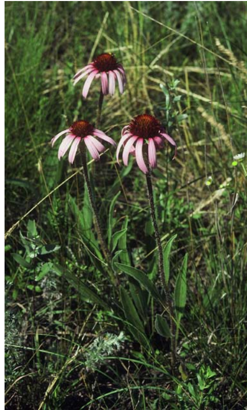
Purple Coneflower