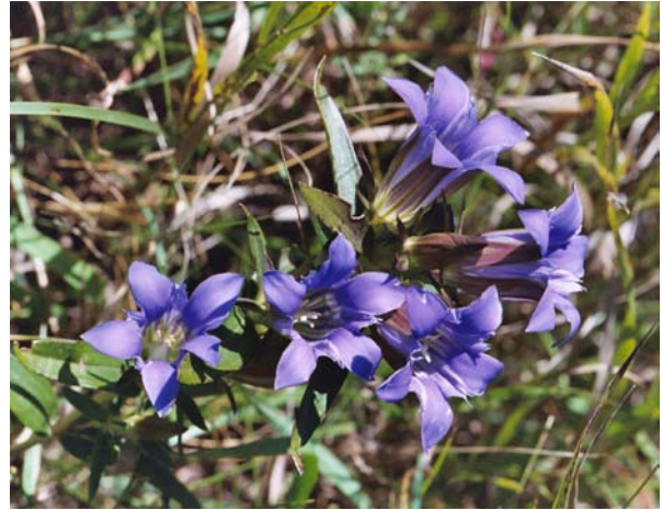
Downy gentian

Both gentians are indicators of high quality prairie and may become extirpated due to overgrazing or a lack of disturbance like fire or haying. These two flowers bloom in late summer from August through September.