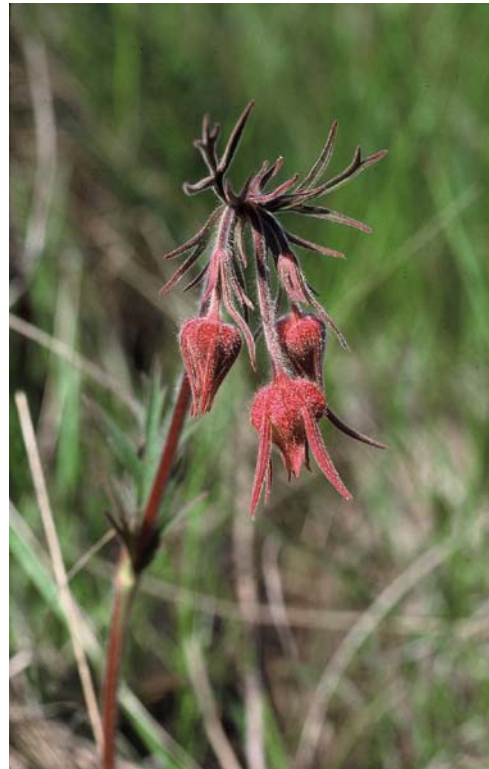
Prairie smoke