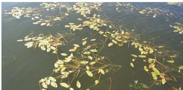
Floatingleaf pondweed, Enemy Swim Lake

These plants live in water from a few feet to fifteen feet or deeper in certain lakes. The depth at which they can grow is limited by the amount of sunlight that penetrates to the bottom. Cleaner lakes like Enemy Swim that have excellent water clarity will have more abundant and deeper beds of these plants. Enemy Swim has one of the most diverse populations of submerged aquatic plants in northeast South Dakota due to its excellent water clarity. A recent survey found twenty-six species of submerged aquatic plants growing in the lake. A decline in water quality that would favor the development of algae blooms would decrease water clarity causing many of these plant species to become extirpated from the lakes flora. Floating-leaf and submerged aquatic plants found in northeast South Dakota lakes are listed below