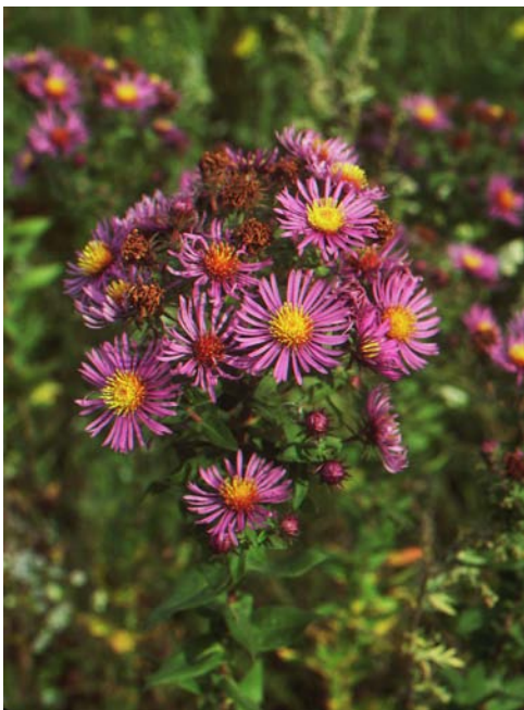
New England aster

Aster ericoides Heath aster Aster novae-angliae New England aster Aster oblongifolius Aromatic, Prairie aster