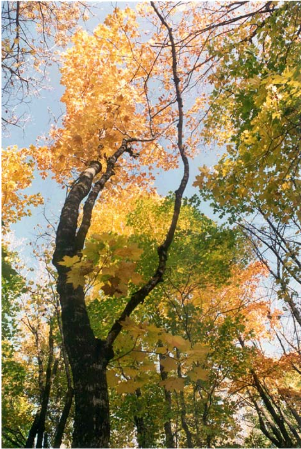
Fall Sugar maples, Sica Hollow State Park

The trees, shrubs, and vines listed below are all native to northeast South Dakota and can be found growing in wooded coulees and riparian forests along the shores of lakes, streams, and wetlands.