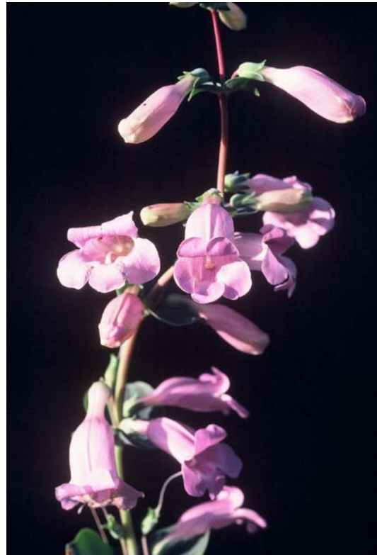
Large flowered penstemon

Lilium philadelphicum Wild lily Lithospermum canescens Hoary puccoon Lithospermum incisum Fringed puccoon Lobelia spicata Pale-spike lobelia Lygodesmia juncea Rush skeleton plant Monarda fistulosa Wild bergamot Oenothera biennis Common evening primrose Onosmodium molle False gromwell Oxalis violacea Violet wood sorrel Oxytropis lambertii Locoweed, Lambert crazyweed Pedicularis canadensis Common lousewort, Wood betony Penstemon albidus White beardtongue Penstemon gracilis Slender penstemon