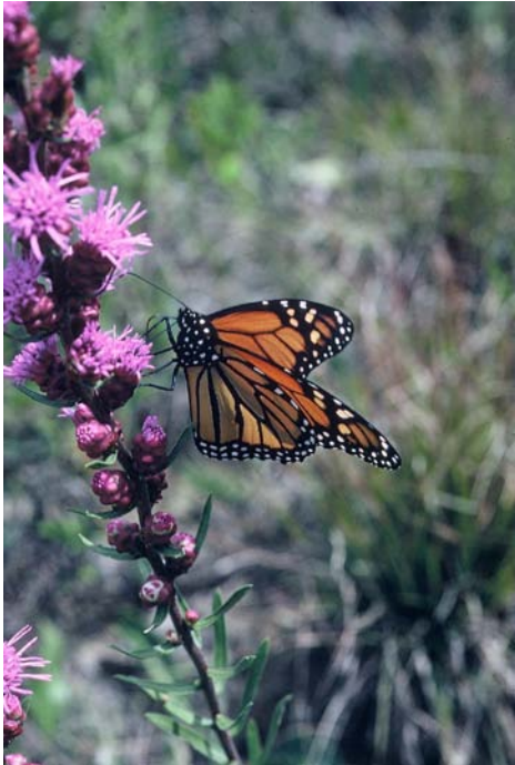
Monarch on rough gayfeather

Hypoxis hirsuta Yellow star grass Kuhnia eupatorioides False boneset