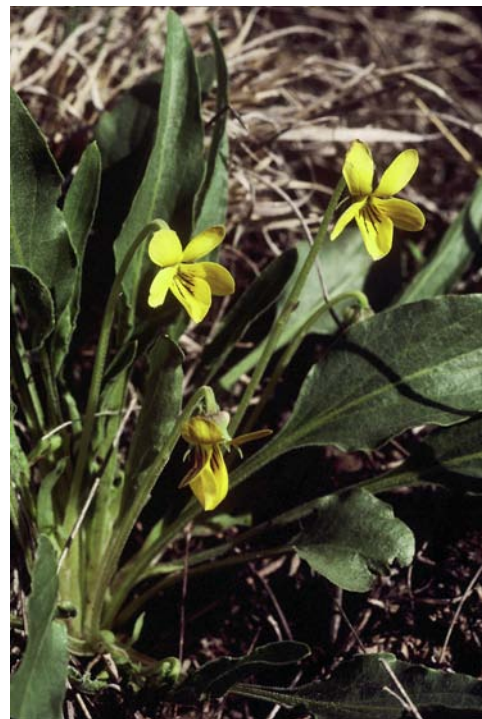
Nuttall's violet

These two prairie violets are important larval food for several species of fritillary butterflies, including the rare Regal fritillary. Female Regal fritillaries are apparently able to detect dormant violet plants in late summer and lay eggs on nearby vegetation. When fritillary larvae hatch in the spring they feed on the emerging violet plants. In many areas of the United States, the loss of native prairie has led to the decline of both violets and fritillaries. The nuttall's and prairie violets bloom from May into June.