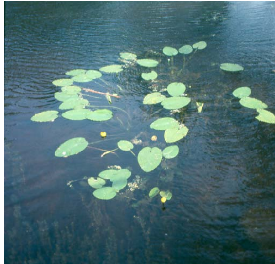
Yellow water lily