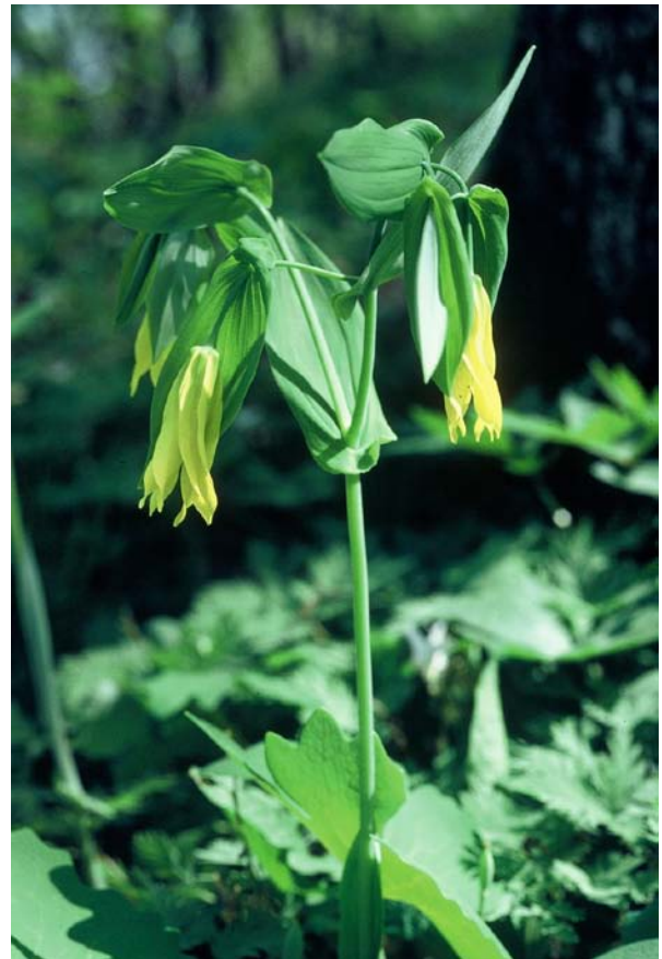
Large-flowered bellwort

The word trillium, or tres in Latin, means three. Trillium plants have three leaves, three petals, and three sepals. The nodding trillium is named due to the blossom that hangs downward below three large leaves. This plant is found in rich woods having acidic soils. It has been observed in several of the wooded coulees including Sica Hollow, Munson's Gulch, and Red Iron Springs. Nodding trillium blooms from May into early June.