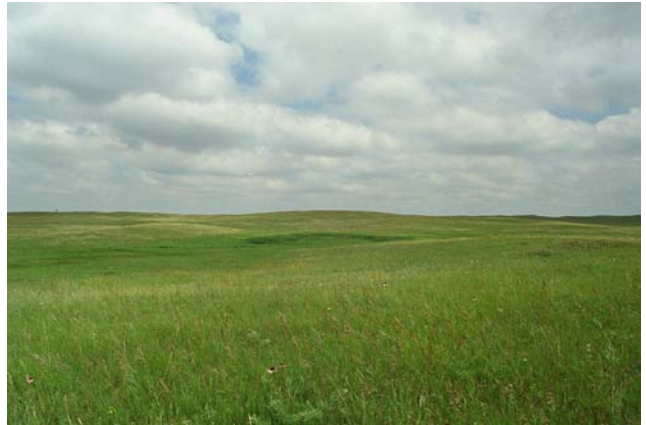
Native tallgrass prairie near Blue Dog Lake

Some of the largest contiguous tracts of native tallgrass prairie remaining in the state are found in northeast South Dakota. What you'll find is largely dependant on how these prairies are managed.