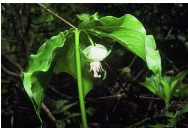
Nodding trillium

Uvularia grandiflora Large-flowered bellwort Viola canadensis Canada violet Viola pubescens Yellow violet