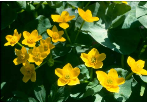
Marsh marigold

The swamp milkweed and joe-pye-weed (page 17) grow along the edges of permanent wetlands and streams. Both species bloom July through August.