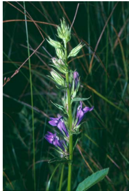
Great blue lobelia