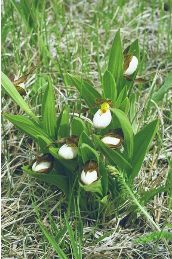
Small white lady's slipper

the S.D. Dept. of Game, Fish, and Park's Natural Heritage Program staff.