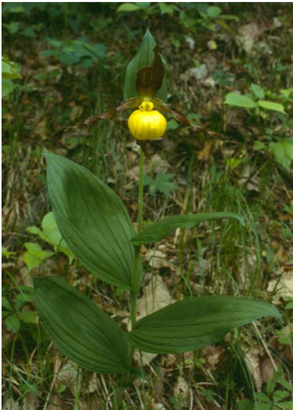
Yellow lady's slipper