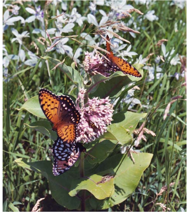
Regal fritillaries nectaring on common milkweed

Apocynum sibiricum Prairie dogbane Artemisia frigida Fringed sagewort