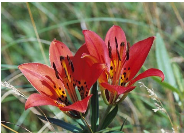
Wild lily

Liatris aspera Rough gayfeather Liatris punctata Dotted gayfeather Liatris pycnostachya Tall blazing star, Prairie blazing star