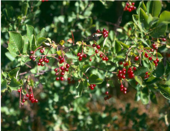
Choke cherry fruit

Salix discolor Large pussy willow Salix eriocephala Diamond willow Salix exigua Sandbar willow Salix petiolaris Meadow willow